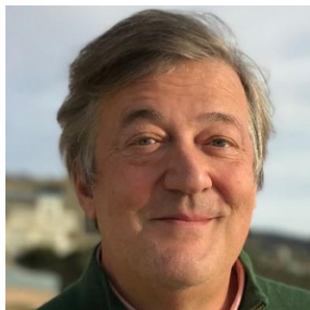
Stephen Fry is a Humanist