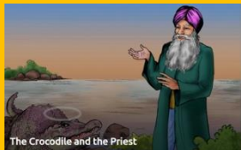
The crocodile and the priest