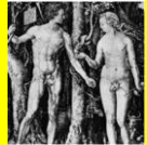
Adam and Eve