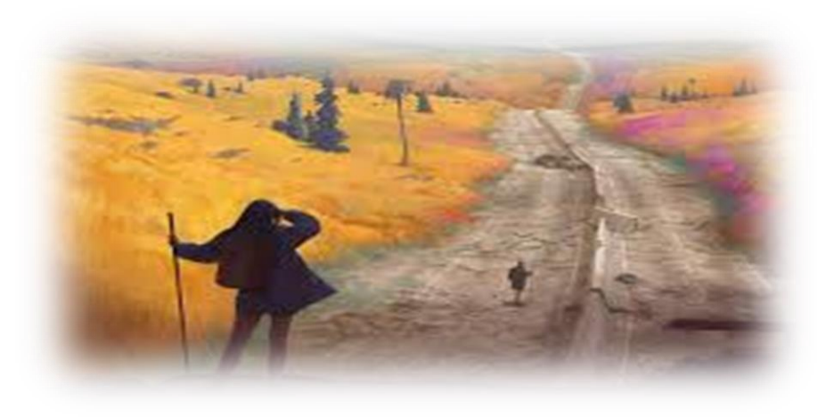
Year Six Learning Leaflet