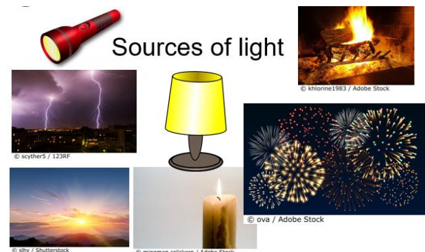
Sources of light

Sound – a vibration that travels and can be heard by the ear.